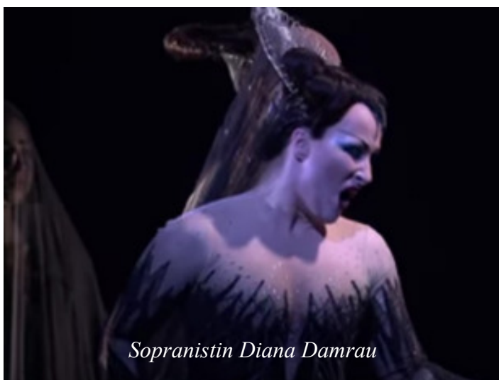
Sopranistin Diana Damrau

"Hell revenge cooks in my heart", commonly abbreviated as "Hell revenge", is an aria sung by the Queen of the Night, a coloratura soprano part, in the second act of Mozart's opera The Magic Flute. It shows an attack of vengeful rage in which the Queen of the Night puts a knife in her daughter Pamina's hand and admonishes her to kill Sarastro, the Queen's rival, otherwise she will deny and curse Pamina.